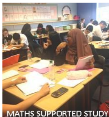
MATHS SUPPORTED STUDY

S3 Computer coding club - Monday lunchtimes - Mr Baird - Computing