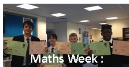
Maths Week :